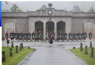
The Royal Guard

HER MAJESTY THE QUEEN'S ROYAL GUARD was provided by C Company, 1 Scots, in 2008. The task runs through the months of August - October and includes not just guarding the Queen but stalking, reeling and participating in highland games. The Company was also honoured by the Battalion's Royal Colonel, who agreed to present Iraq Campaign Medals.