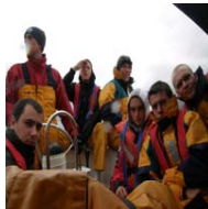
Crew on Sealord, part of the Advanced Soldiers Cadre