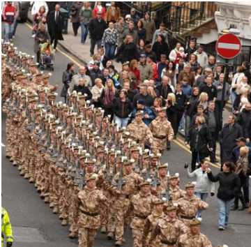
2 Scots march in Penicuik

SCOTS SOLDIERS RETURNING FROM AFGHAN paraded around the country at the end of 2008, to celebrate their homecoming. Soldiers from 2, 4, 5, 6 and 7 Bns deployed as part of 16Bde, to Afghanistan last year. On their return they paraded in different parts of the country, including Canterbury in the south of England, where they received a particularly warm welcome. The 5th Bn were awarded the Freedom of the City during their march in Canterbury; an honour which was not bestowed upon their own local Regiment.