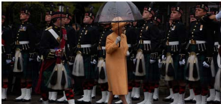
Her Majesty The Queen inspects Her Guard