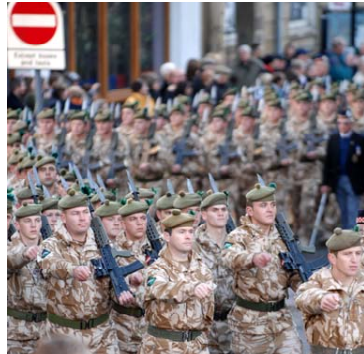
5 Scots march in Canterbury where they were awarded the Freedom of the City