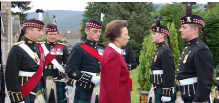
HRH The Princess Royal presenting Iraq Campaign Medals